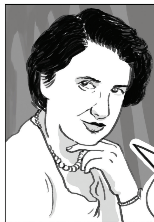
ROSALIND FRANKLIN DNA PIONEER